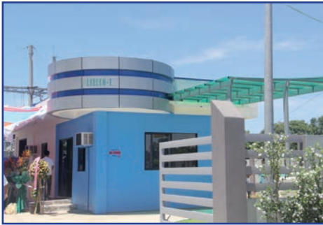
The ISELCO I drive-thru bill payment facility