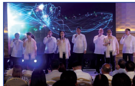
Top to bottom: (1 & 2) Adm. Masongsong, ASec Jonas Jorge Soriano of the Office of Cabinet Secretary give inspirational messages to the delegates of the NEA-ECs Conference in Tagum City; (3 & 4) Davao del Norte Governor Anthony Del Rosario and Tagum City Mayor Allan Rellon welcome the delegates; (5 & 6) SOCOTECO I & II employees showcase their dance prowess to add color to the celebration; (7) the NEA Lights and Sounds Chorale render meaningful songs to the delight of the participants