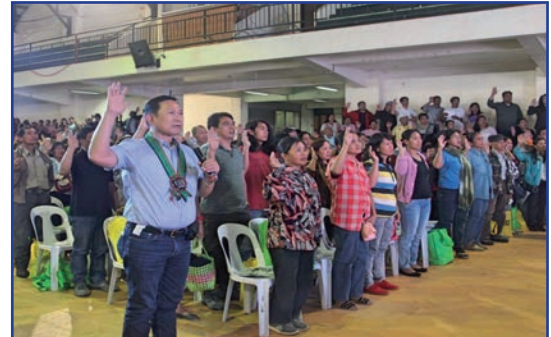
NEA Chief Masongsong joins the new NCECCO members as they take oath during the 37th AGMA of BENECO in Baguio City on 17 June 2017.

Established last January, NCECCO is a national organization that seeks to empower all the electricity consumers nationwide. It serves as a movement of the electric cooperatives (ECs) and member-consumer-owners (MCOs) towards strategic positioning in the power industry and in pursuit of socio-political-economic-cultural-environmental development through rural electrification.